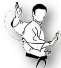
NAGASHI - UKE