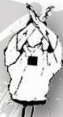
JODAN - JUJI UKE