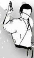
HAISHU - UKE