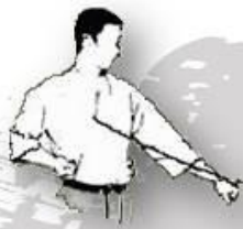
GEDAN - BARAI