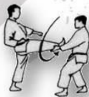
Sukui-Uke (tranchant de main)