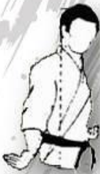
SUKUI - UKE