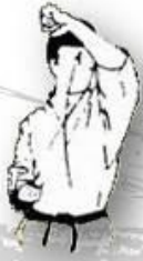
JODAN - AGE UKE