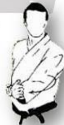
TEISHO - UKE