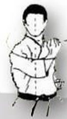
SOTO - UKE