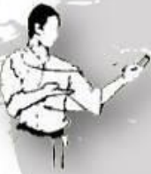
SHUTO - UKE