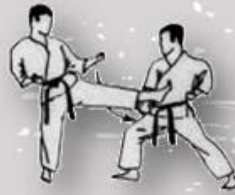
Gedan-Uke avec Haiwan